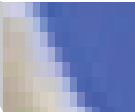
Smooth transition after Video Correction.

• Matte Sizing: Sub-pixel matte sizing and softening allowing for a "Smart Choke & Blur" on the matte.