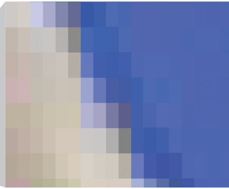
"Blocky" transition from 4:1:1 compression.